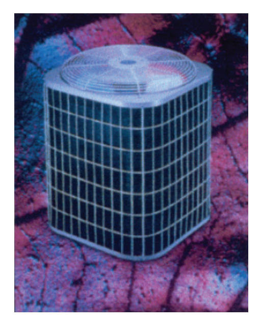
Application Shown: Residential heat pump

Small size, a variety of mounting options, and outstanding thermal response, makes the 3NT an excellent temperature control for dehumidifiers, freezers, heat pumps, ice makers, refrigerators, or any place where a fixed temperature control is required in a wet or dirty environment.